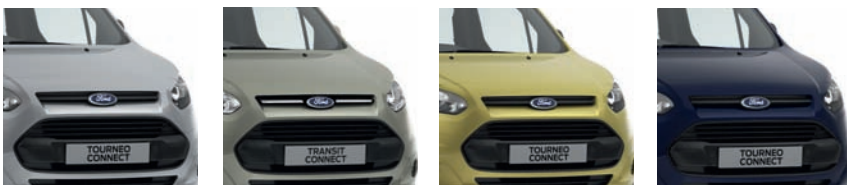
Moon dust Silver