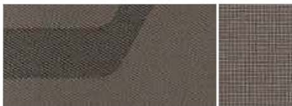
Medium Stone seat pack

Available on Titanium as a No Cost Option (Not available with heated seats)